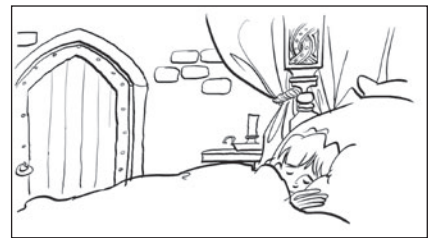
That night / she / go to sleep.