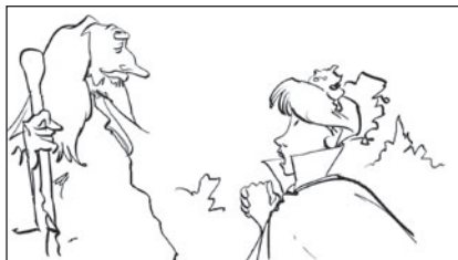
The princess / ask / the wizard / to stop / the dragon.