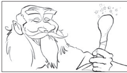
The wizard / want / to help / her.