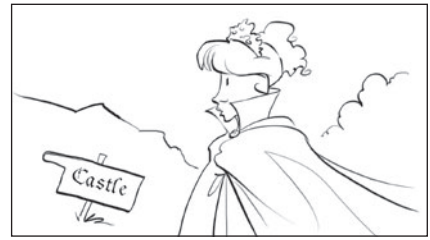
He / use / some magic / and / she / go / home.