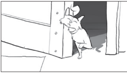
It / be / her cat!

1 Write one sentence for each picture using the notes. Use the past simple form of the verbs.