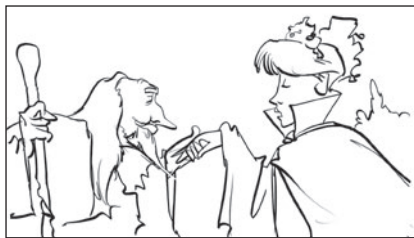
She / go for a walk / and / meet / a wizard.