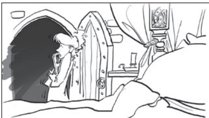
There / be / a princess / who / be / very scared.